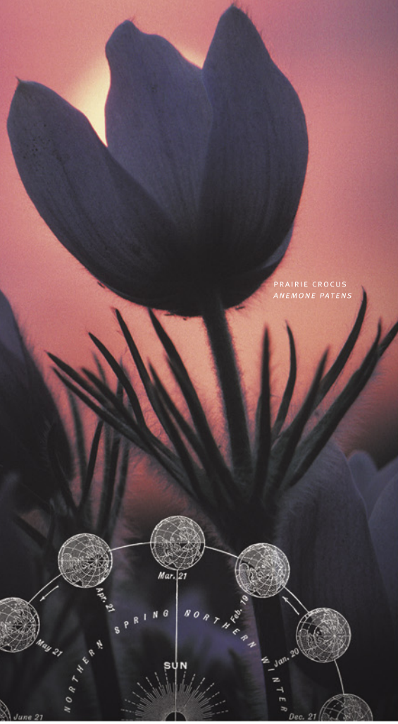
PRAIRIE CROCUS ANEMONE PATENS