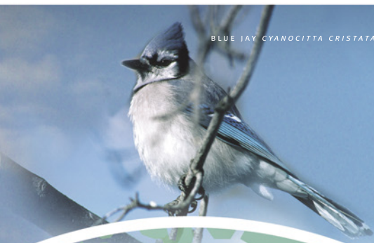
BLUE JAY CYANOCITTA CRISTATA