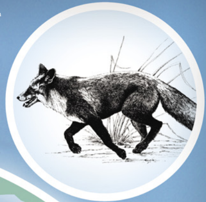
RED FOX VULPES VULPES