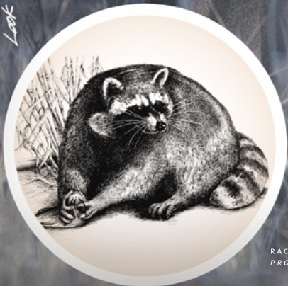
RACCOON PROCYON LOTOR

When I take the time to listen, I am bettered by the quietude and peacefulness that nature offers, and I am rewarded by the kaleidoscope of dramatically changing seasons... a delightful additional bounty is the natural harvest of berries, herbs, wild mushrooms, and occasional game.