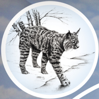
BOBCAT LYNX RUFUS