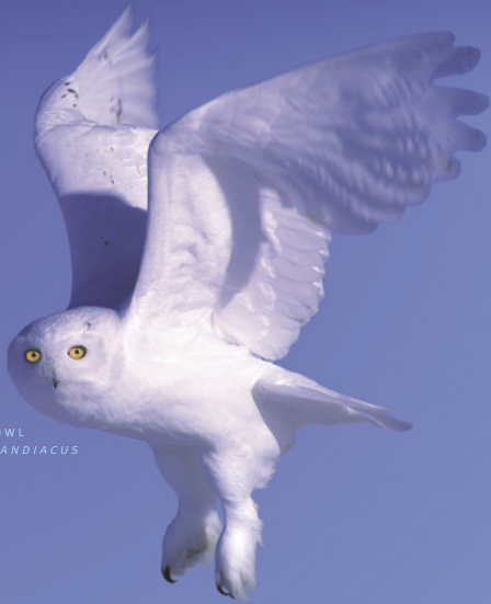
SNOWY OWL BUBO SCANDIACUS