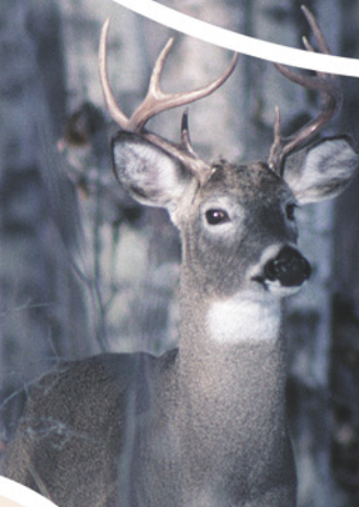
WHITE-TAIL DEER ODONCOLLEUS VIRGINIANUS

Man's heart away from nature becomes hard. -- Standing Bear