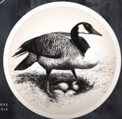
CANADA GOOSE BRANTA CANADENSIS